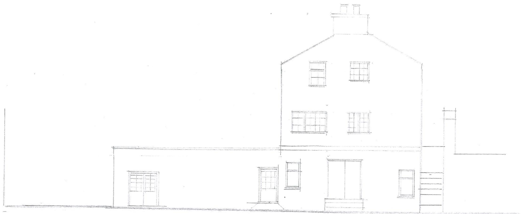
existing elevation to canal 1:100